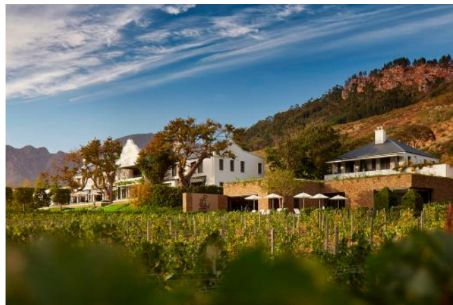
View from and of The Manor House, Leeu Estates

Re-opening rates for the Leeu Collection South Africa properties are, based on two people sharing a double room on a B&B basis, as follows: