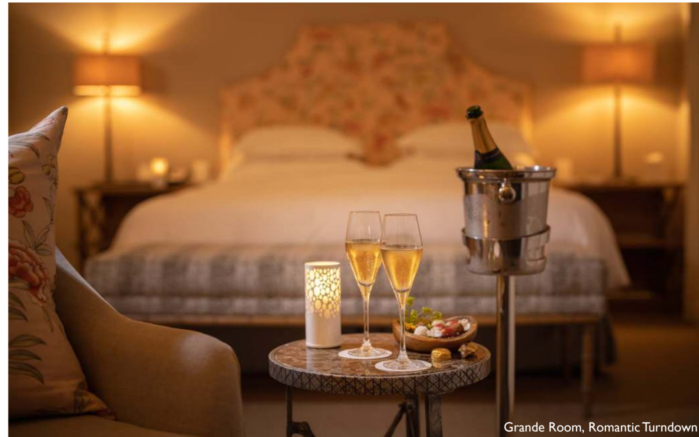
Grande Room, Romantic Turndown