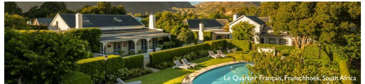
Le Quartier Français, Franschhoek, South Africa