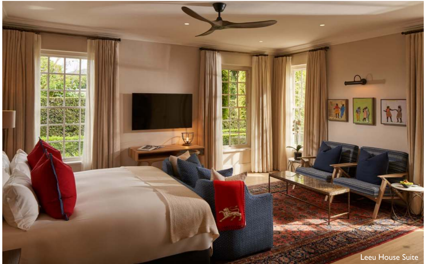
Leeu House Suite