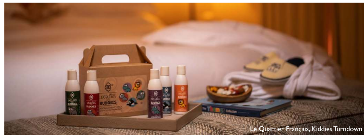
Le Quartier Français, Kiddies Turndown