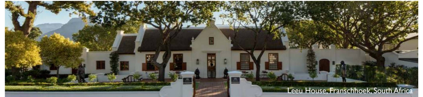
Leeu House, Franschhoek, South Africa