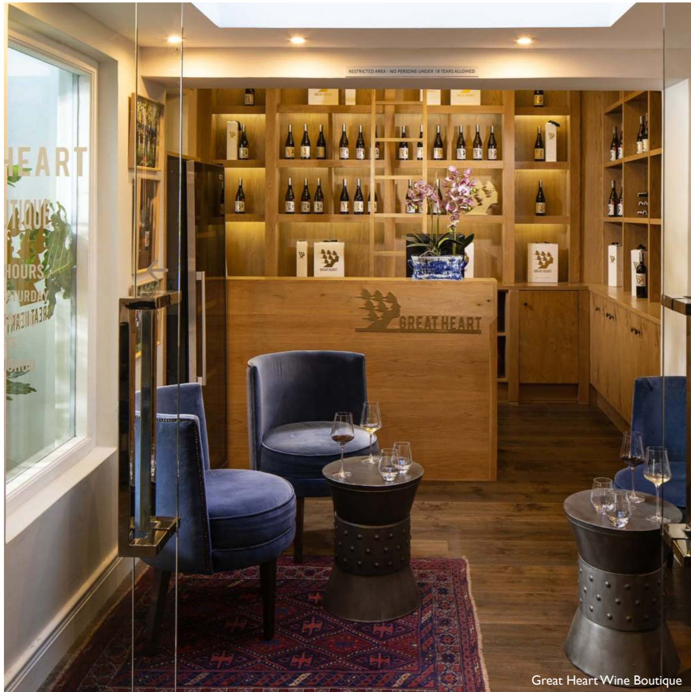
Great Heart Wine Boutique