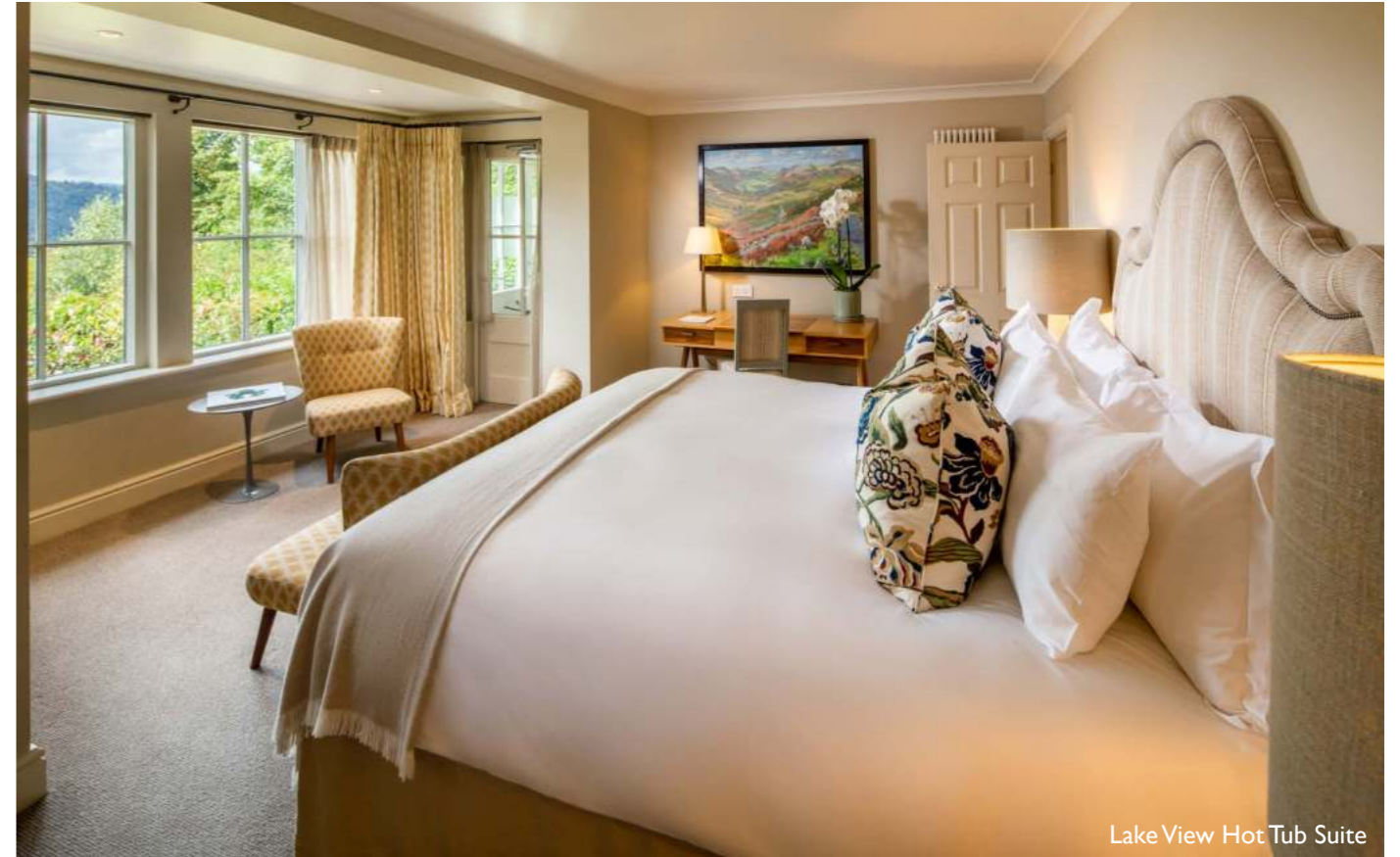
Lake View Hot Tub Suite