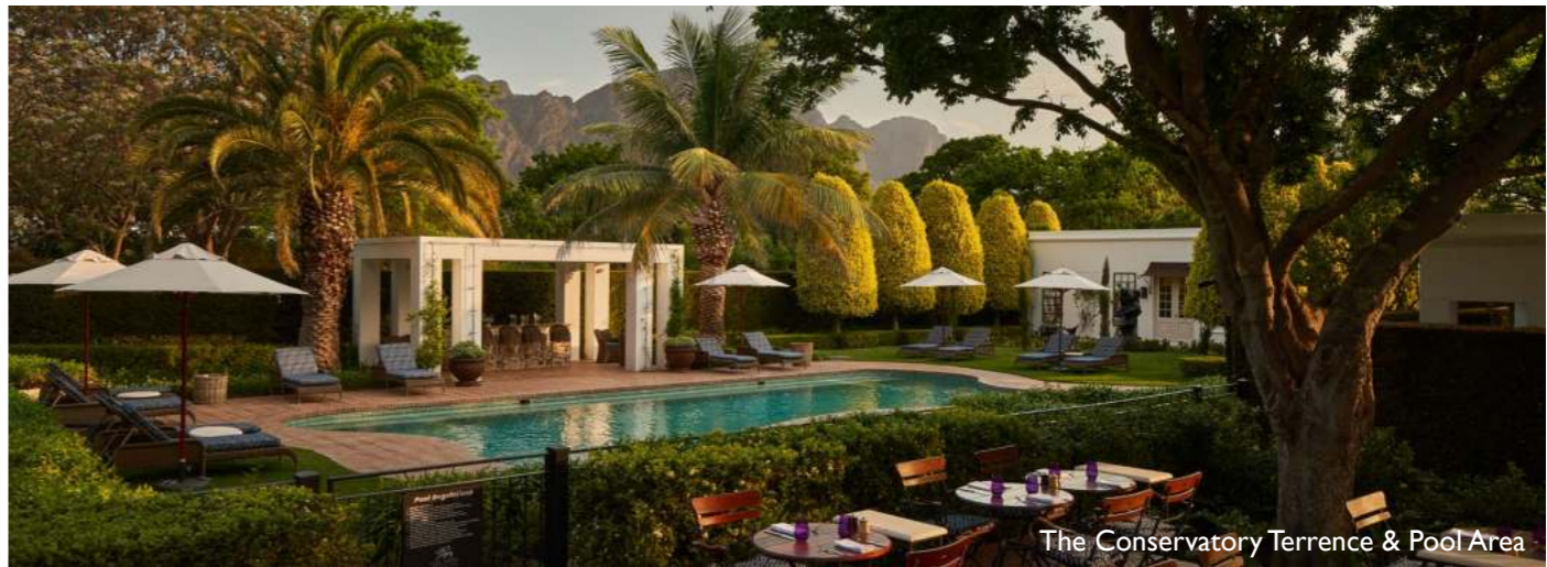
The Conservatory Terrence & Pool Area