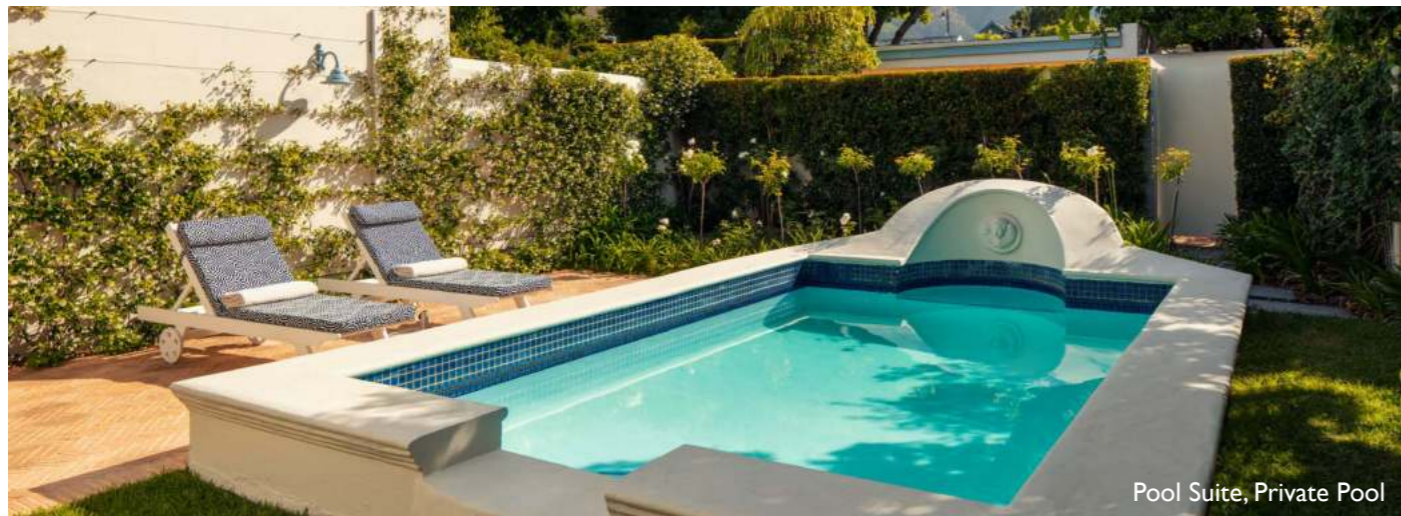
Pool Suite, Private Pool