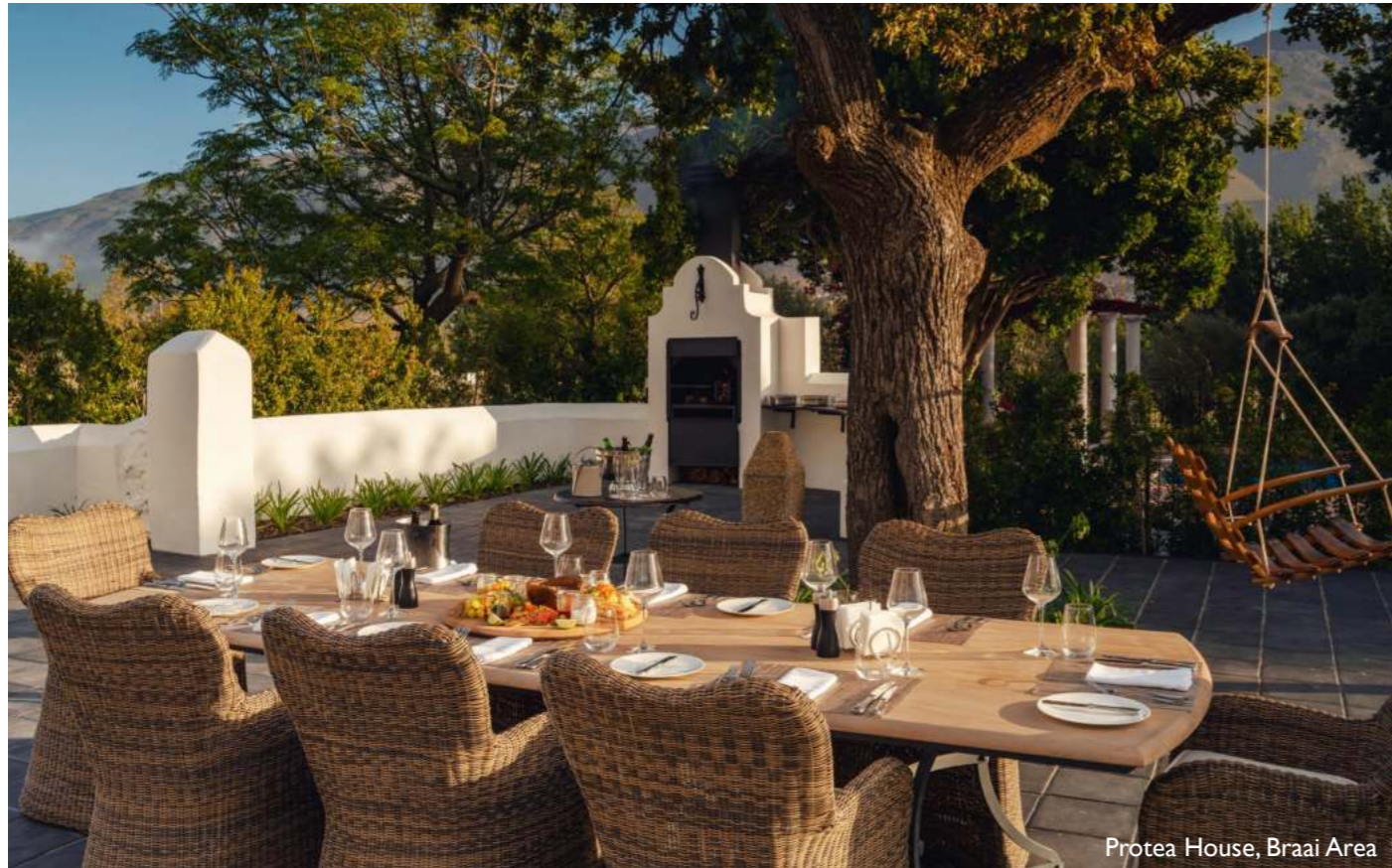
Protea House, Braai Area