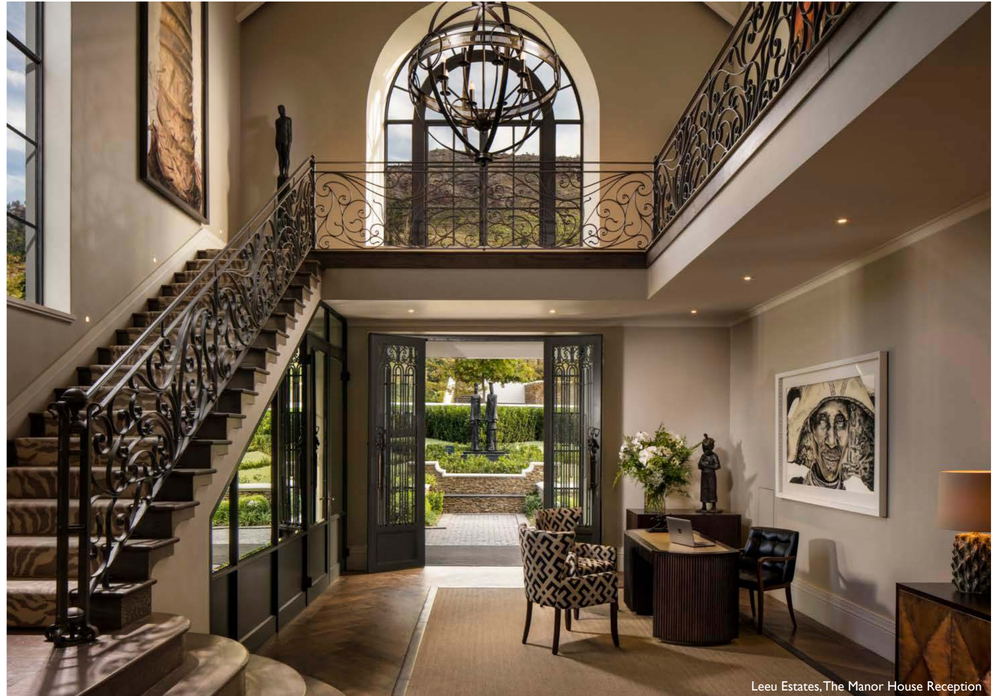
Leeu Estates, The Manor House Reception