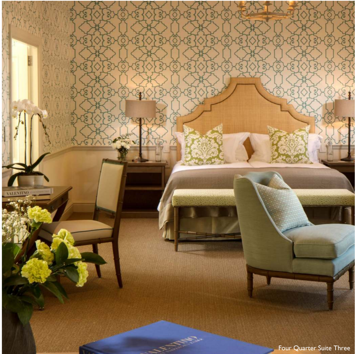
Four Quarter Suite Three