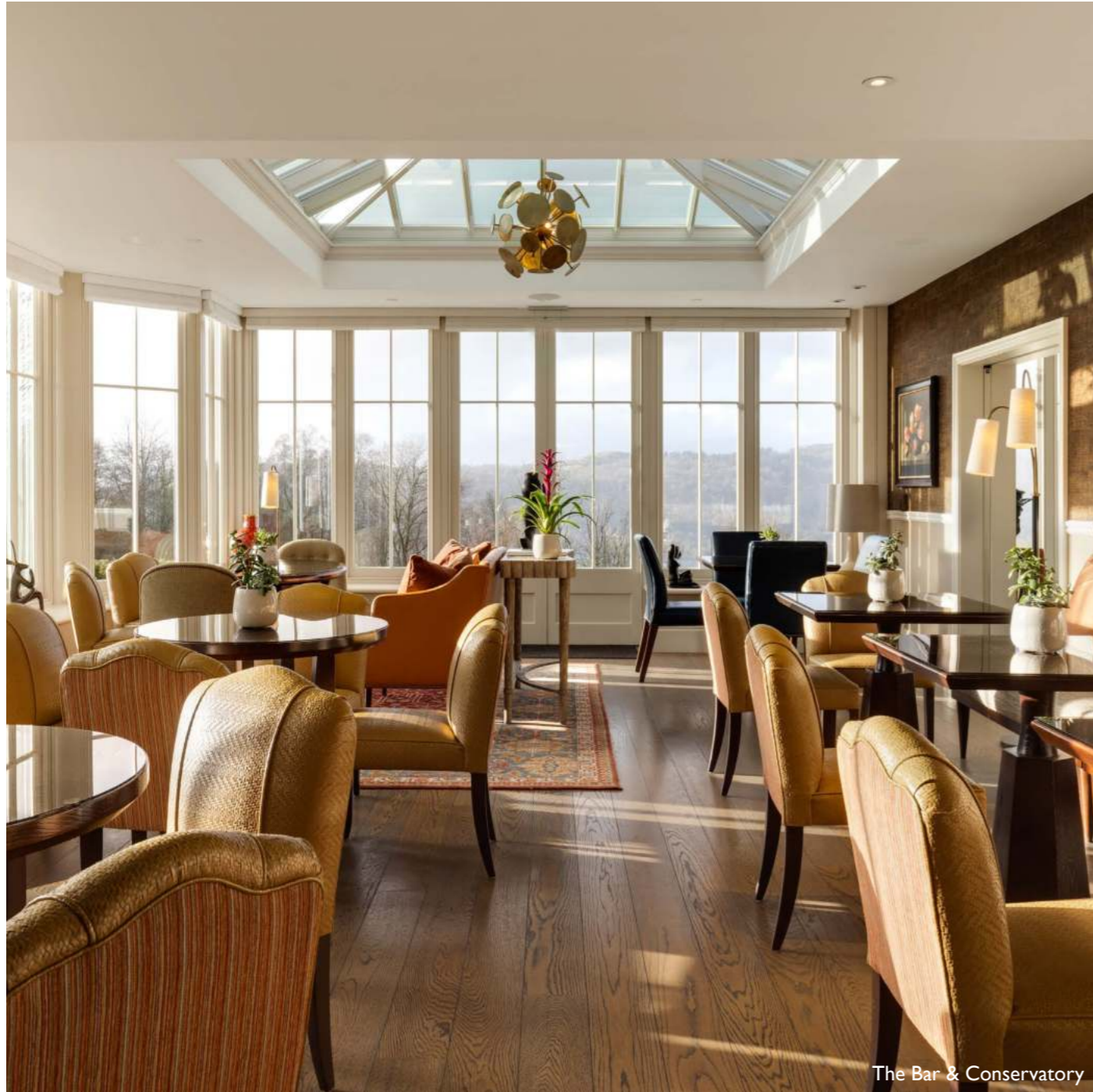
The Bar & Conservatory