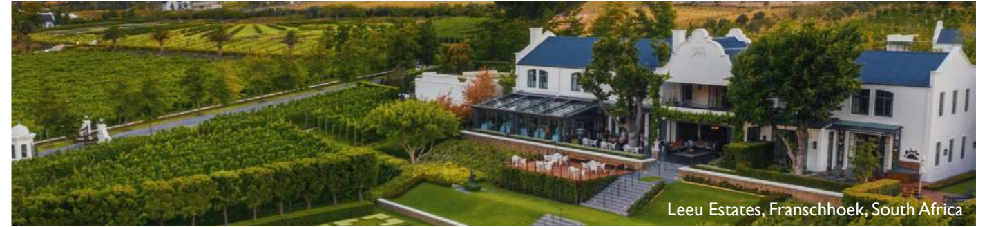
Leeu Estates, Franschhoek, South Africa

Everard Read, the oldest commercial art gallery on the African continent, was established in 1913. Specialists in contemporary art from South Africa and the diaspora, their sixth gallery, Everard Read Franschhoek, is adjacent to Le Quartier Français. The gallery at Leeu Estates augments the existing gallery in the high street of Franschhoek, showing monumental sculptures in the breathtaking fynbos and vineyards, as well as exhibiting important works by our artists in the purpose-built gallery on site.