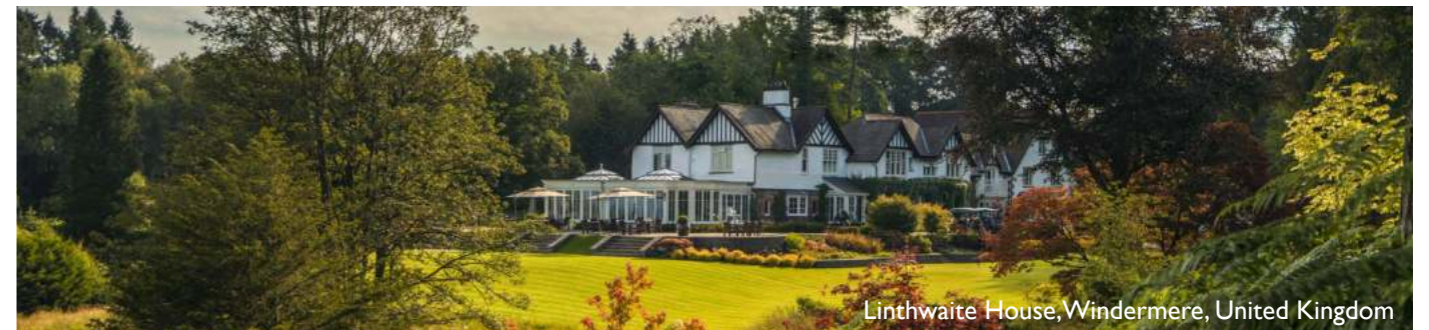
Linthwaite House, Windermere, United Kingdom